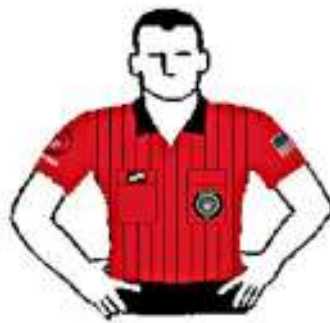
3 LINE VIOLATION