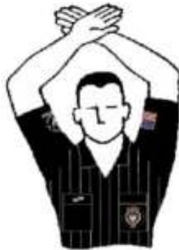
REFEREE TIME OUT