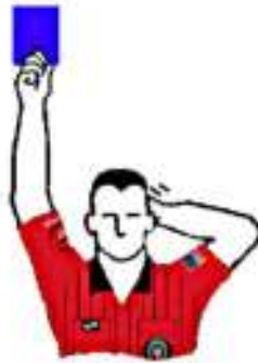
BLUE GAME MISCONDUCT